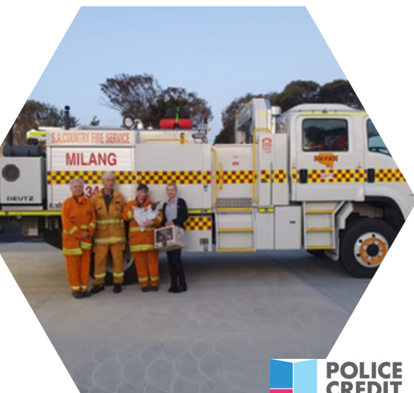
Milang brigade being presented with their coffee machine

A huge thank you to PCU for their generosity in supporting our CFS volunteers.