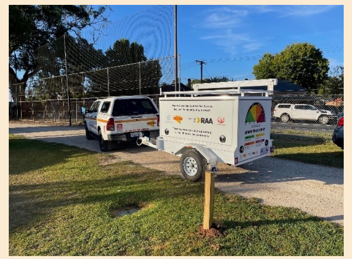
The new SA CFS Community Engagement Trailer is out on location.

Thanks to the RAA's contribution, we have been able to enhance our outreach efforts and bring crucial fire safety information directly to communities. The CFS Community Engagement Trailer serves as a vital resource, and the RAA's support has played a pivotal role in making this project a reality. Their dedication to fostering community well-being aligns seamlessly with our mission, and we are sincerely thankful for their partnership in creating a safer and more informed environment for everyone.