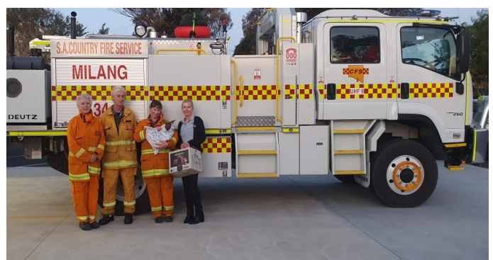
Milang CFS Brigade receiving their coffee machine from PCU.