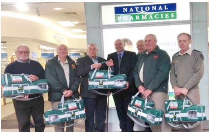
National Pharmacies donating Oxy Vivas to the CFS Foundation

SA Power Networks has been a year on year supporter of the CFS Foundation and we appreciate their donation which went to the Volunteer Support Fund.